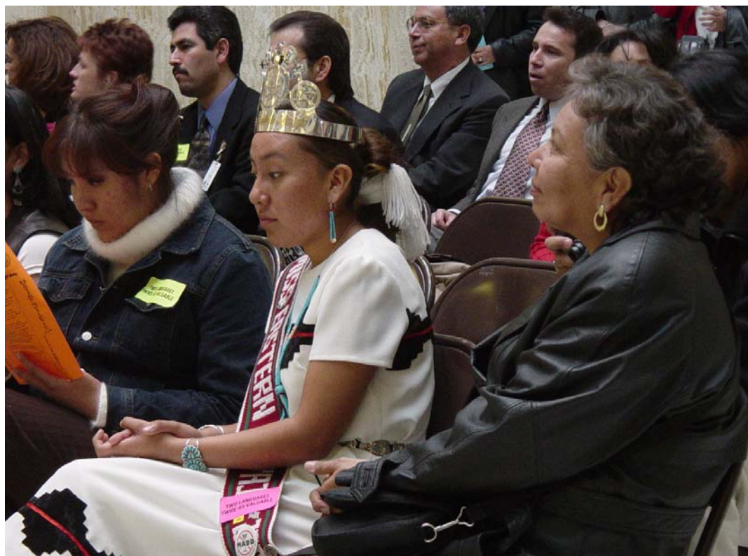
Mis s Eastern Navajo Nation

505-769-0472 (office and FAX) nmabe@plateautel.net