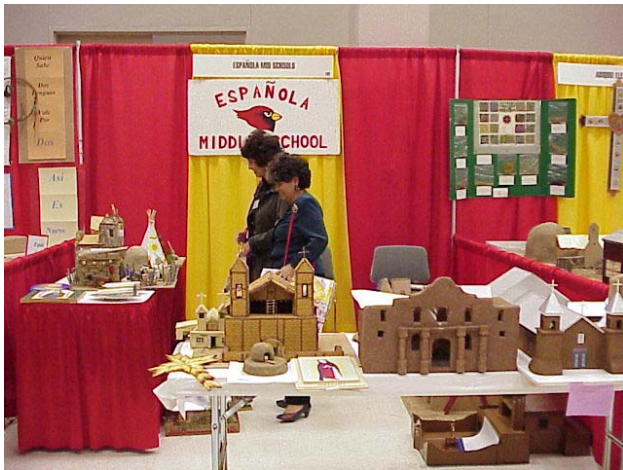
School Exhibit, NMABE - 2003

NMABE is proud to once again offer schools the opportunity to participate in school exhibits. Schools will be assigned only one six foot table which includes two chairs. Schools may bring their own additional tables. Maximum number of schools exhibiting will be limited to 20 .