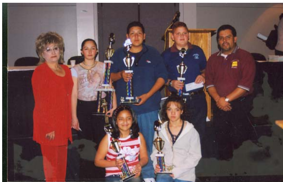
NMABE Spanish Spelling Bee Contest Winners, 2003

District-Champion _____ Age _____ Grade _____ Alternate _____ Age _____ Grade _____ Sponsor _____ Phone _____