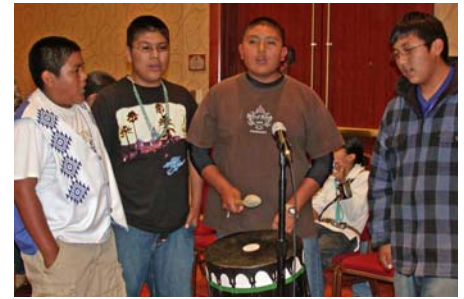
San Diego Riverside Singers

While the spelling bee, reading and speaking categories often have academic ties to school-based learning, the students express their traditional values through the singing and dancing contests. Navajo students must introduce themselves in Navajo giving their