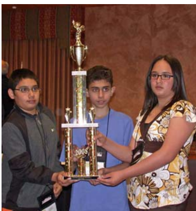
The Three First-Place Winners

Every year, all observers—parents, siblings, district representatives, judges, sponsors, and NMABE Board members—are quietly excited as students tackle the words given. However, this year it was even more compelling.