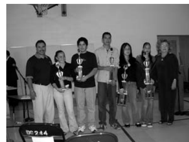
All winners take pride in their awards.